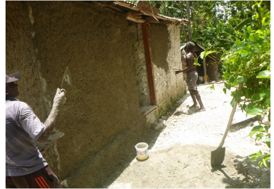
House being re-built, thanks to our Earthquake Relief Program

In the lower communities closer to Gattienau (where security risks are minimal), we had dump trucks deliver cement, sand and tin close to the homeowners' houses. Local committees were set up to help with supervision of the distribution process, all under the direction of Gemi and Wilton, our own Community Development staff. Everything went smoothly and new houses are starting to go up all over the area! We were able to help 1083 families in 21 communities!