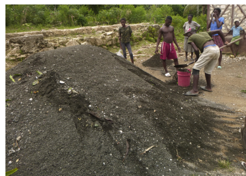
Truckload of sand divided into 4 equal parts for distribution to 4 homeowners