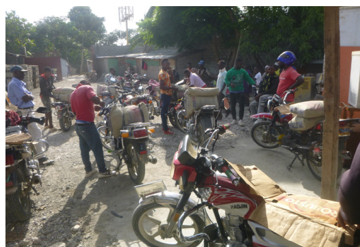
Sacks of cement loaded onto motorcycles for transport up the mountain to recipient

Due to security issues, we had people in the higher mountain communities come to the warehouse to pick up their cement and tin directly from the supplier. We paid each homeowner a small stipend to cover the cost of transportation by motorcycle up to their home. Then, we contracted with dump trucks to deliver sand to the communities, with distribution being supervised by our Community Promoters. Each truckload of sand was divided into 4 portions, one for each of 4 homeowners, who transported the sand in sacks and buckets from the drop-off area to their homes.